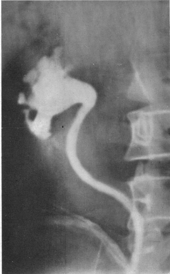
FIG. 3.—Pyelogram of papilloma of kidney pelvis. To bring out the delicate contrast shadows in the pelvis which was filled with a spongy papilloma, the original film had to be reversed and then printed.

Pathological diagnosis and microscopic report was "papilloma of kidney pelvis with early malignant changes."