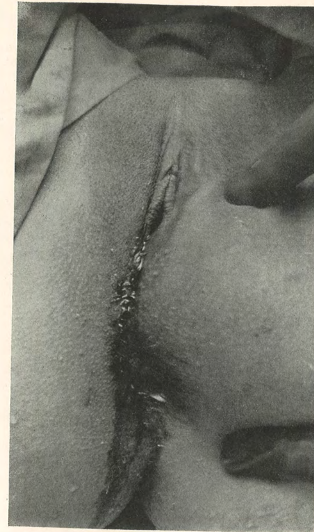
Sarcoma of ischio-rectal fossa. Two-thirds normal size. Age 21.